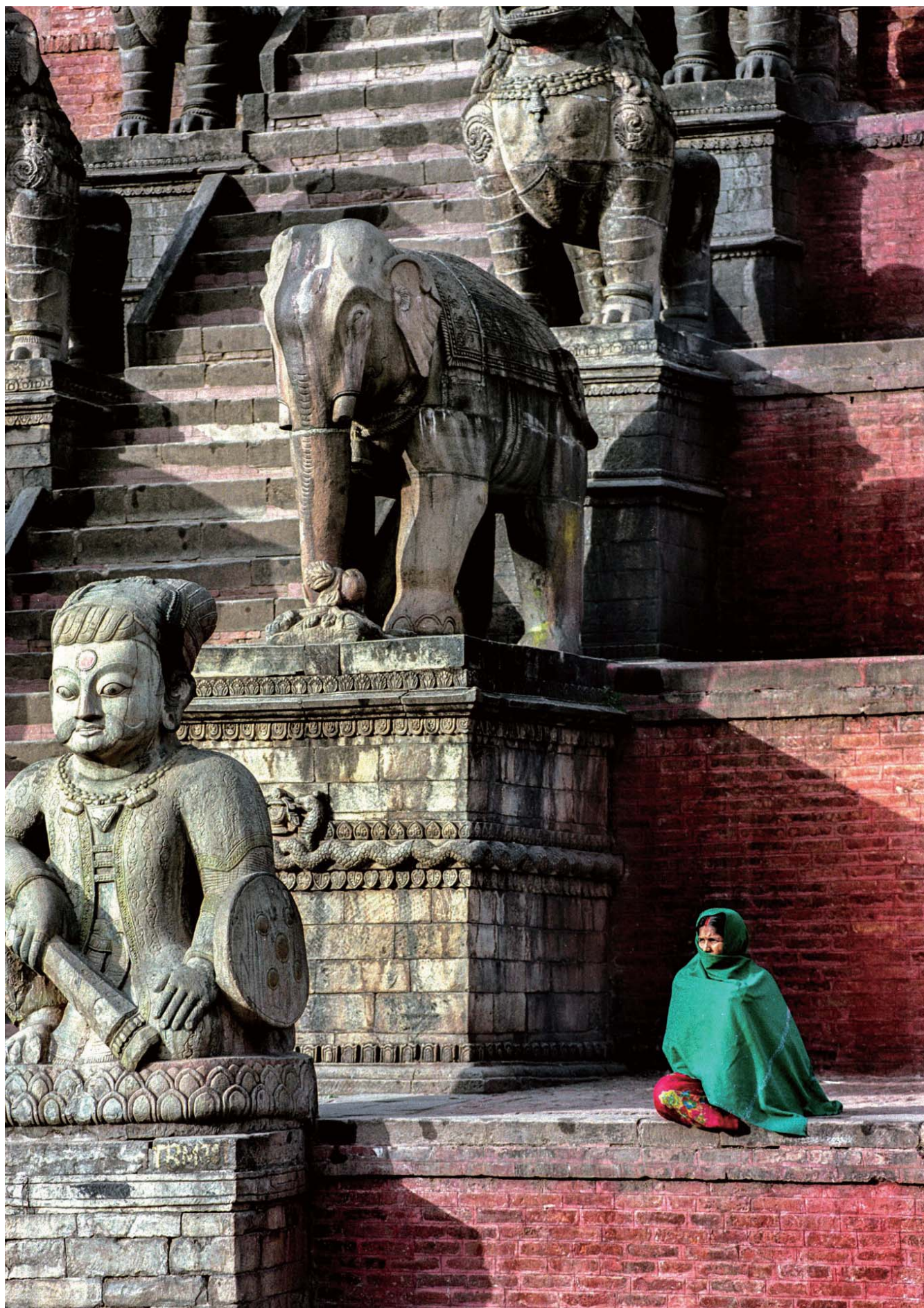
神庙下的石像 Stone Statue under the Temple