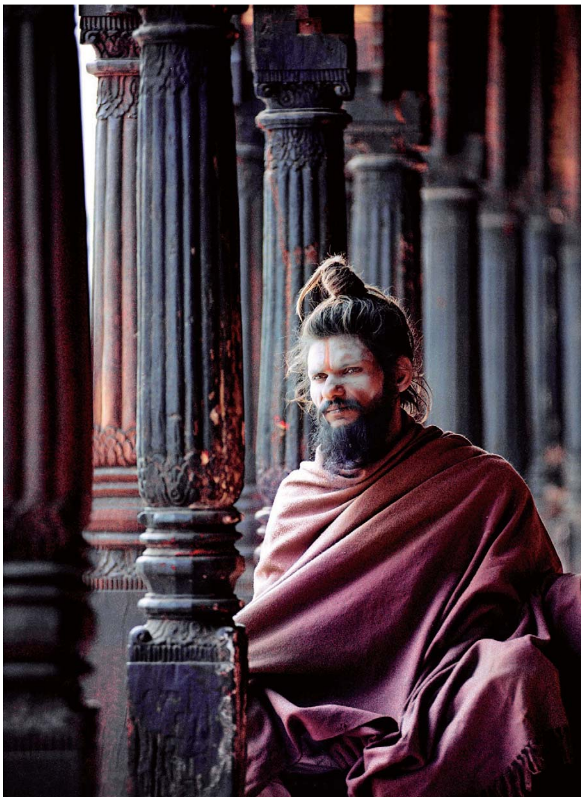
印度教毗湿奴派的修行者 Vishnu Faction Monk