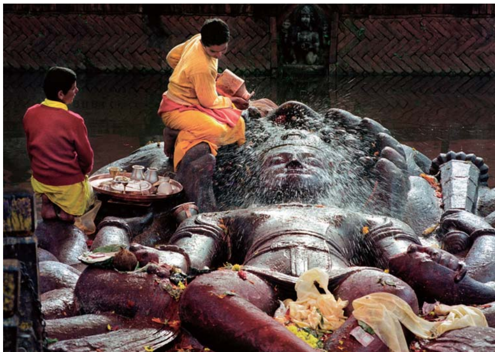
布达尼尔堪莎寺的毗湿奴神像 Statue of the Budhanilhantha Vishnu