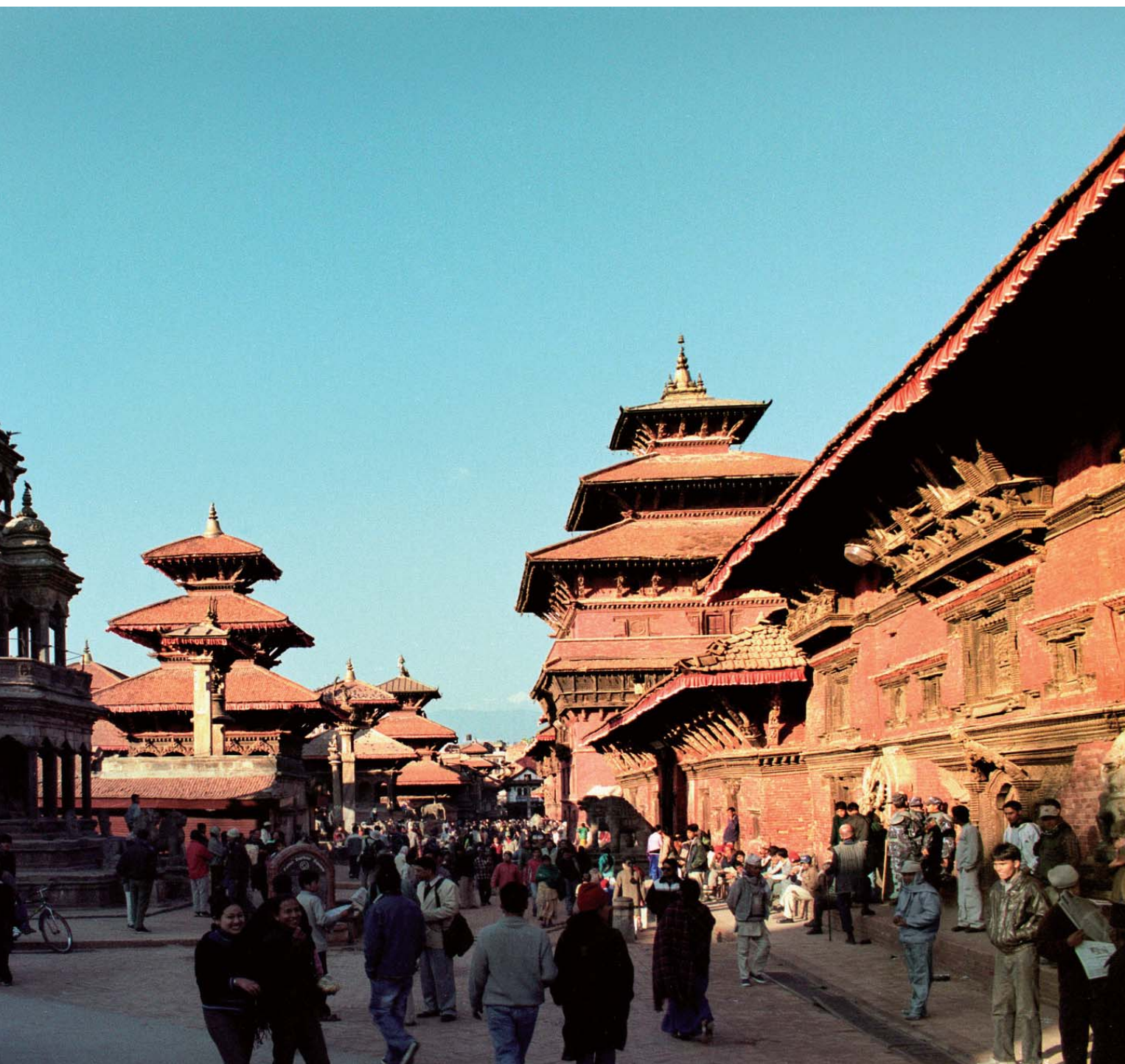
帕坦古城 Patan, the Ancient City