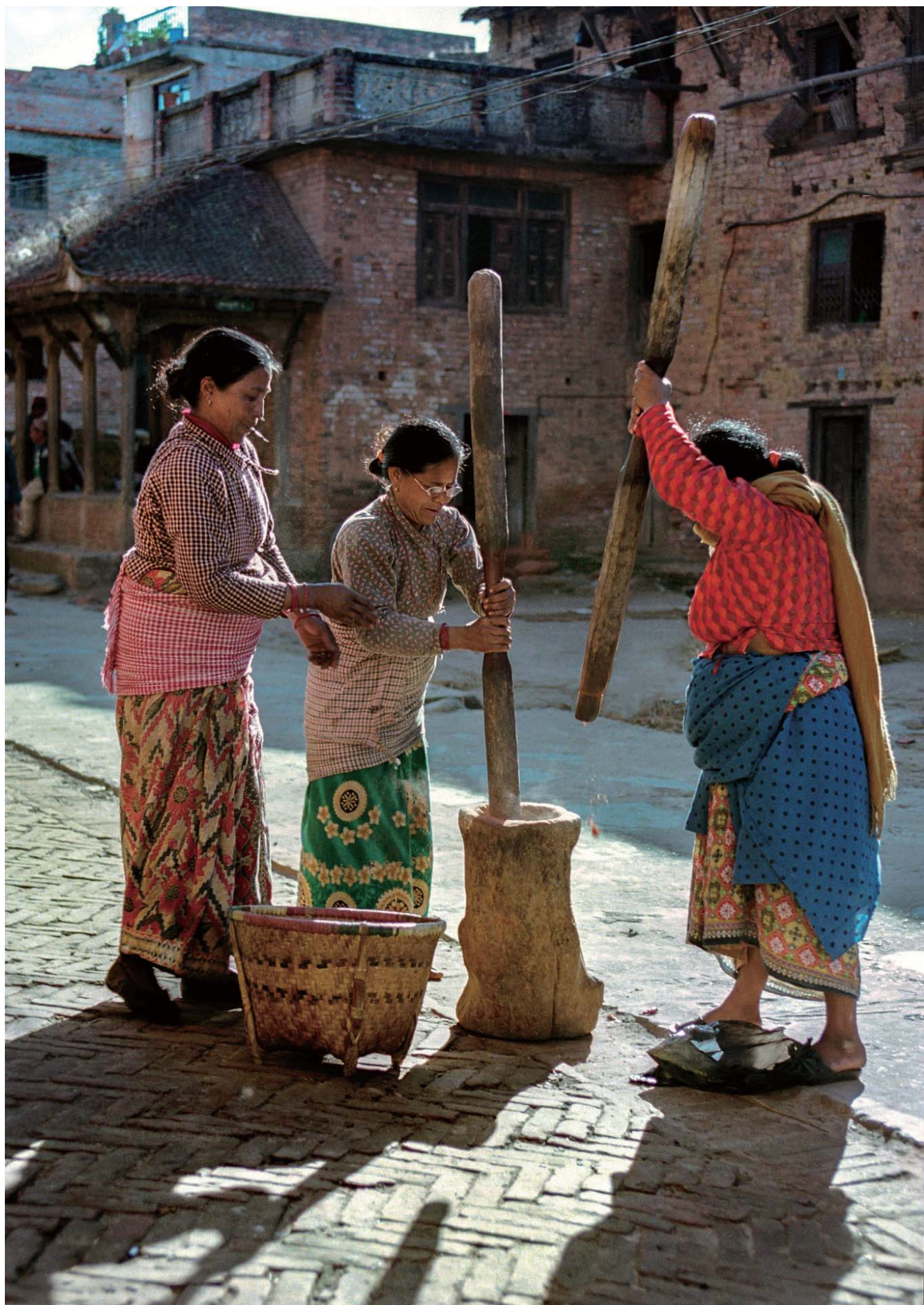
春辣椒 Grinding Chilies